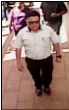
Suspect # 1